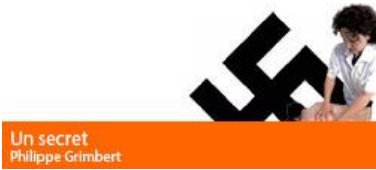
Un secret Philippe Grimbert